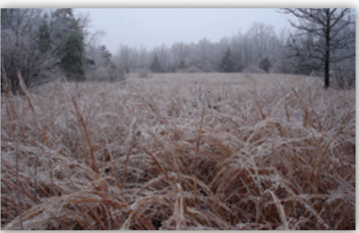
Little Bluestem on ice