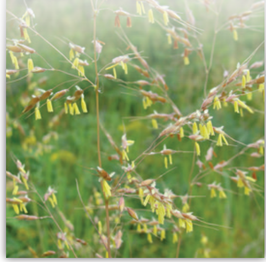
Switchgrass flowers in bloom