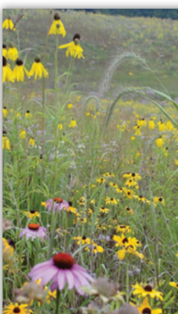
established native vegetation