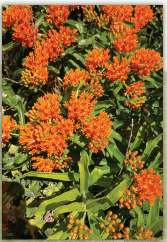
Butterfly Milkweed blooms