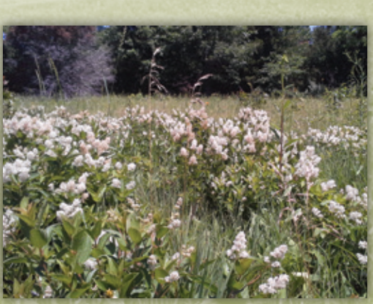
New Jersey Tea

Make a note of our new location and phone number.