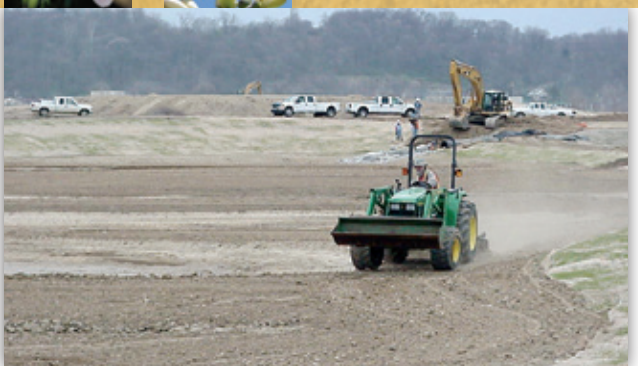
Site preparation for wetland mitigation, Cincinnati, OH