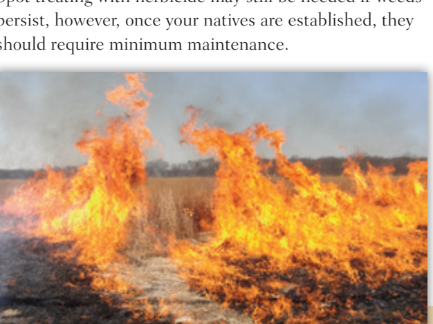
Prescribed burns are an effective tool for weed management.

Spot treating with herbicide may still be needed if weeds persist, however, once your natives are established, they should require minimum maintenance.